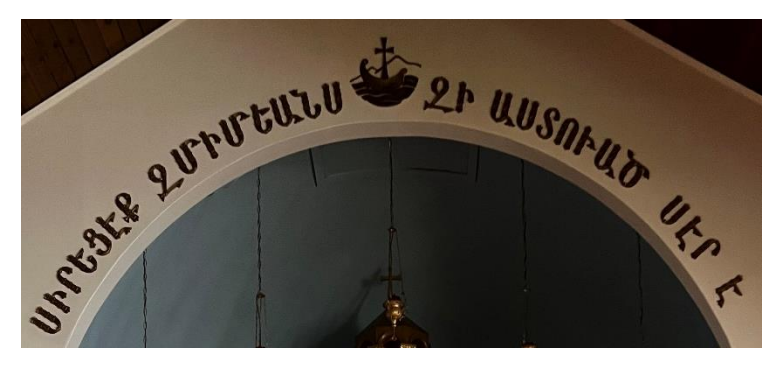
It is written in classical Armenian which says, "Love one another, because God is Love".

Do you know what the writing above the altar says?