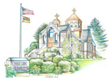
St. Leon Armenian Church NJ